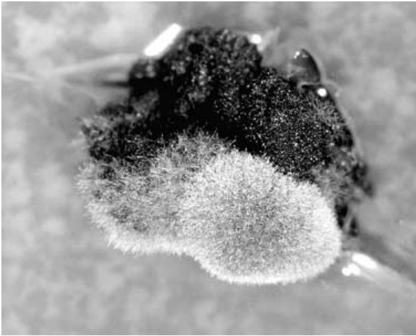
Figure 2 Colony of Pseudotaeniolina globosa on oatmeal agar, 21 days. Colonies raise considerably from the agar surface. On top of the solid colony mycelial growth develops \times 4 .